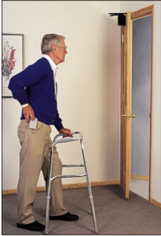
Simplifies Your Day