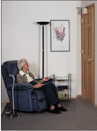
Perfect For In-law Arrangements