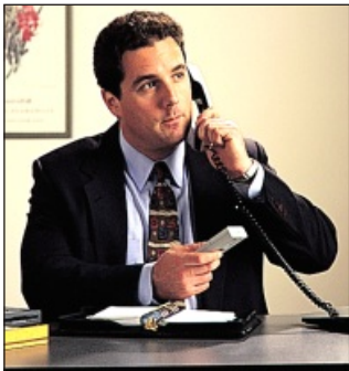
Provides Privacy in the Office