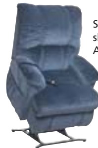
Space Saver shown in Atlantic fabric

Batteries not included. Safety System is designed to bring chair from recline to seated position in the event of a power outage.